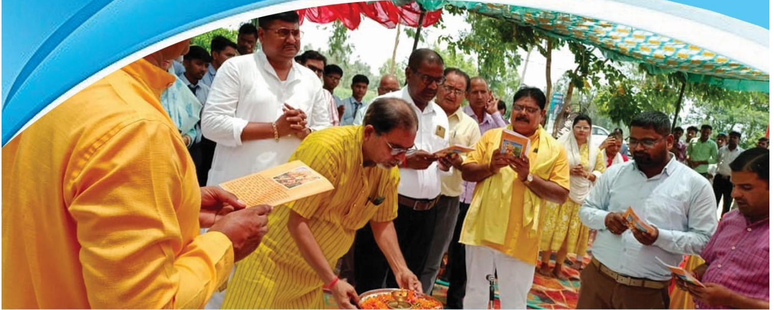
Bhandara organised by Maa Kamla Devi Shri Pitambara Vidyapeeth